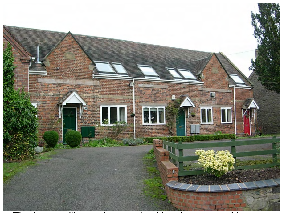
The former village primary school has lost some of its charm with the insensitive use of artificial materials and insertion of large roof lights on the street elevation.