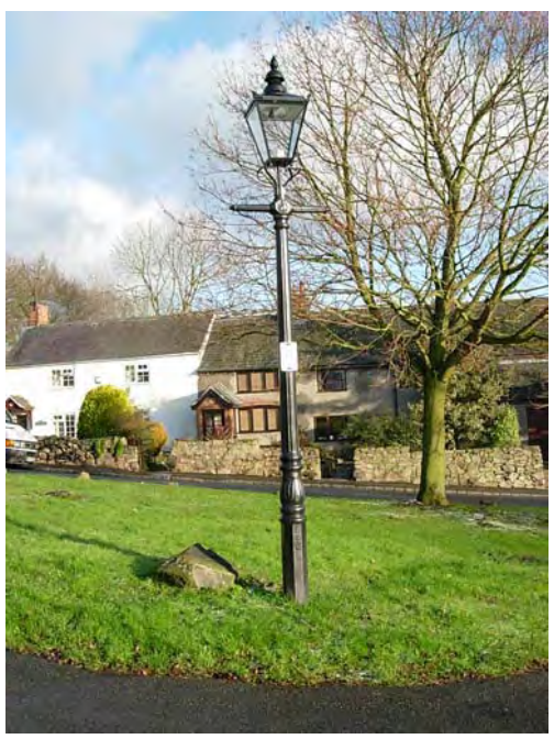
Several traditional cast iron heritage street lights have recently been installed sited around the village greens which add to the charm of the conservation area.