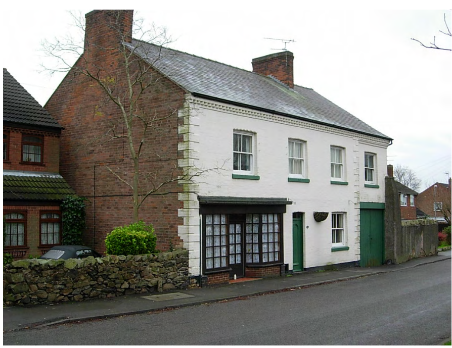
36 Main Street was once the village bakery. The property has now been converted into a dwelling although the shop front and bake house still remains.