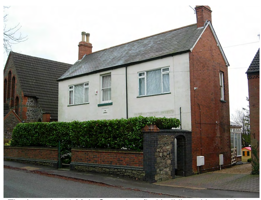
The Laurels, 40 Main Street is a find building although it has lost some of its traditional character with the insertion of two large windows on the front elevation.