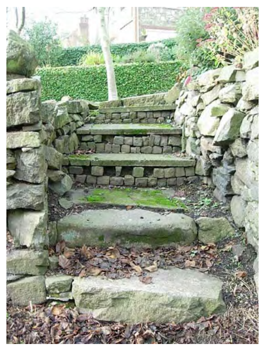
The steps leading up to 51 The Green are in need of maintenance.