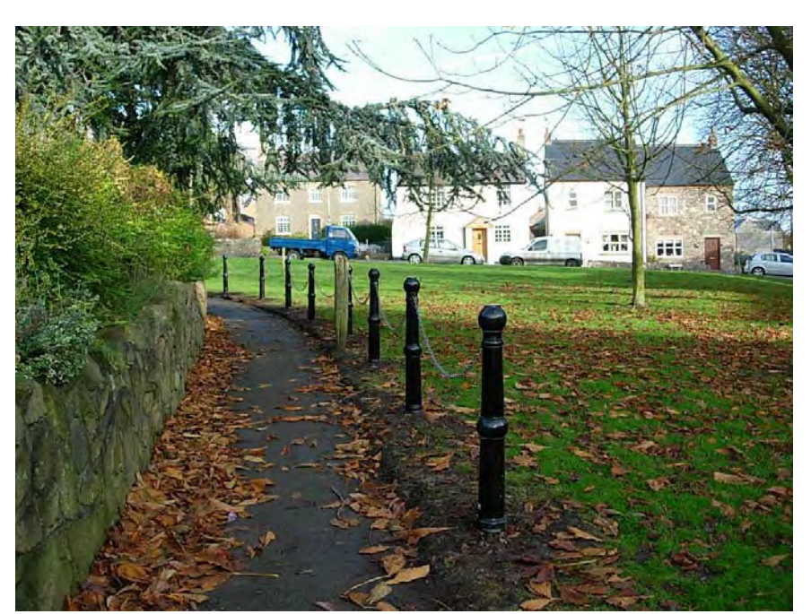
The unsightly timber post sited on Saw Pit Green marks the location of a well. It is suggested the timber post is replaced with an information board.