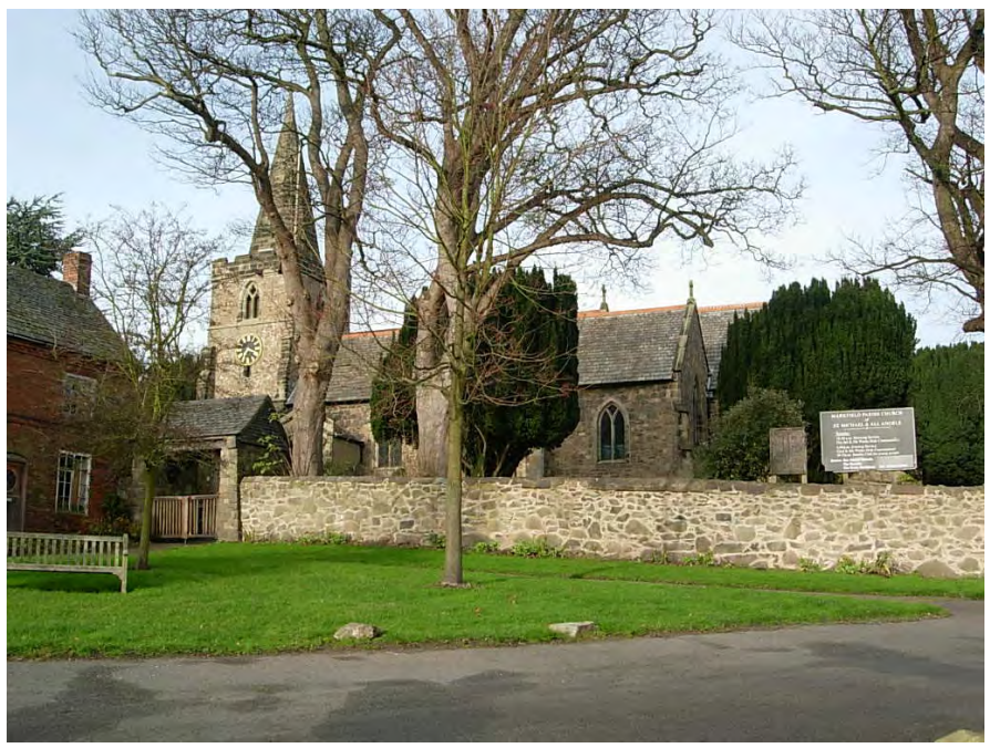
The Grade II* listed parish church of St Michael built in granite with slate roofs and a short spire is a prominent landmark in Markfield. The Church is flanked by excellent granite walls and the graveyard contains some fine mature trees and interesting gravestones.