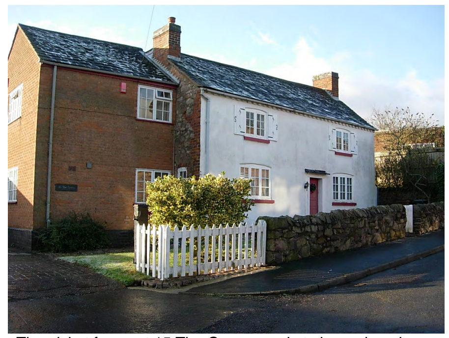
The picket fence at 15 The Green needs to be replaced with a granite wall to match the existing wall.