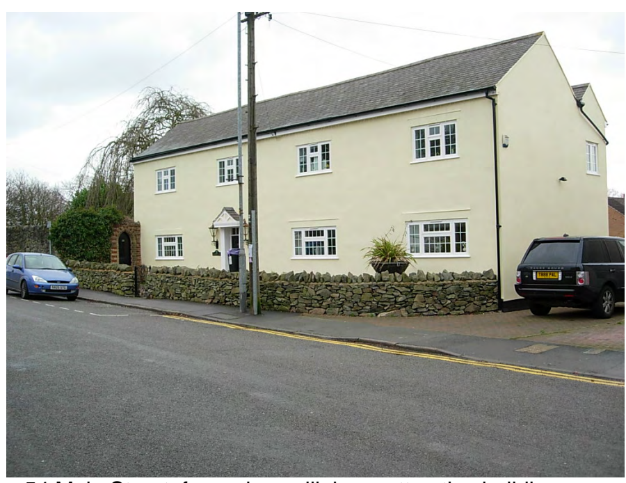
54 Main Street, formerly a mill, is an attractive building that has an excellent granite wall fronting the premises.