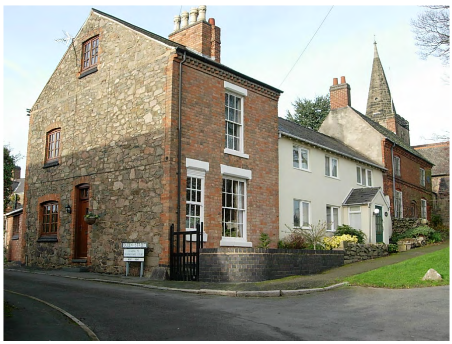
The dwellings adjacent to the church lichgate provide a fine setting for the church with their different roof heights and materials.