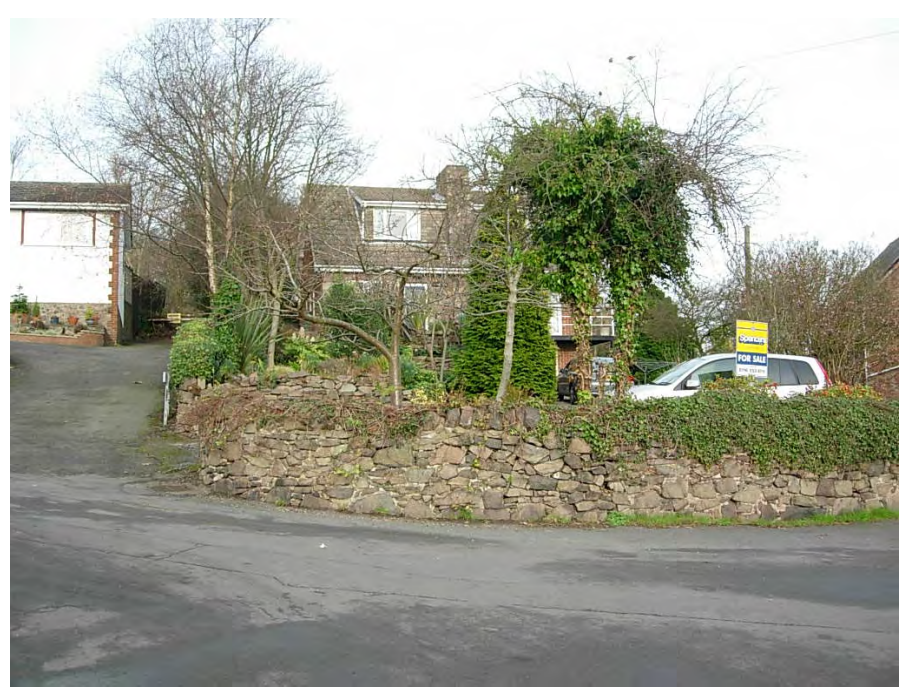
This dormer bungalow at 61 The Green does not reflect the traditional character of the village, although it does have a good stone wall running around its cartilage.