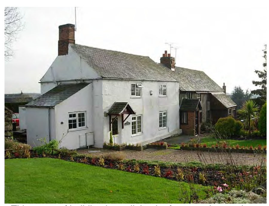
This group of building is spoilt by the front porches and canopy that tend to dominate the properties.