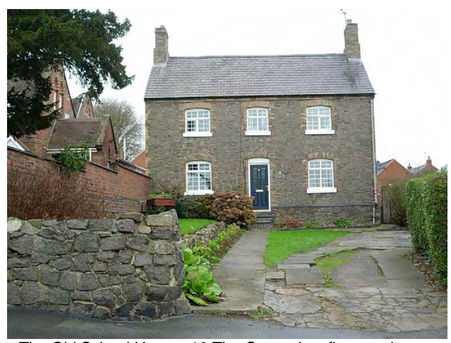
The Old School House, 10 The Green, is a fine granite dwelling with a slate roof and two chimney stacks but the car parking space fronting the property needs attention.