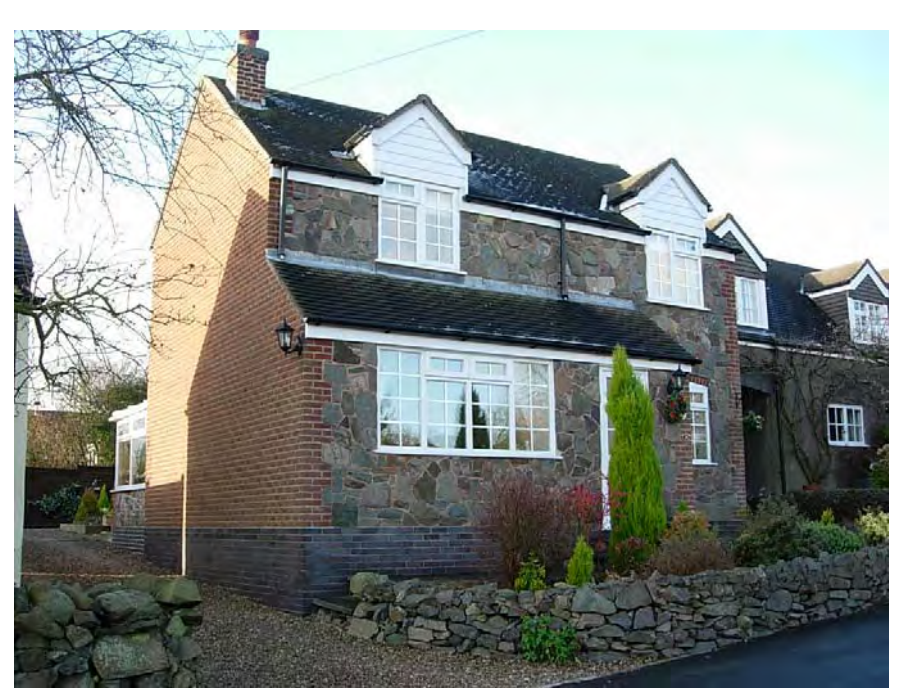
31 The Green has many none traditional features that detract from the conservation area. They include half dormers, overly large window openings and inappropriate modern materials.