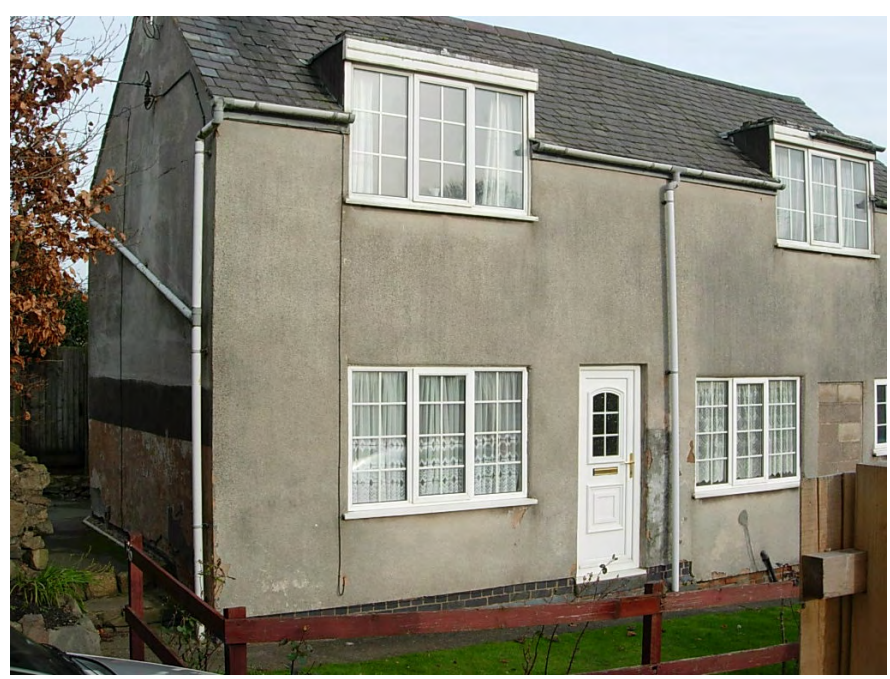
52 The Green that was originally two cottages that has lost its traditional character with its conversion into a single property and use of modern materials.