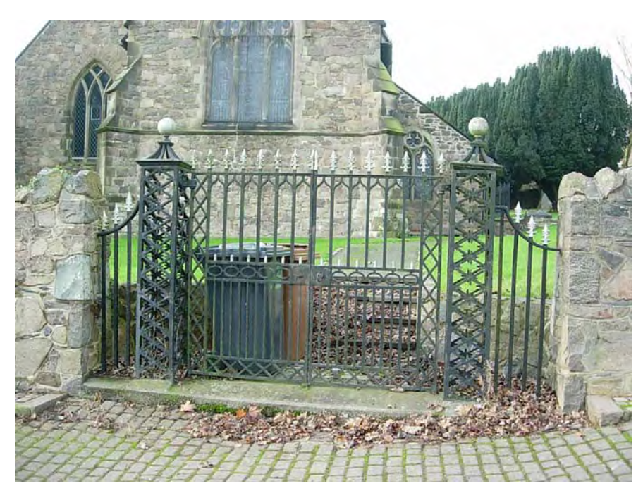
Cast iron gates circa 1820 with their pierced openwork side piers. The Grade 2 listed gates are an excellent feature sited on the east side of St Michael's Church.