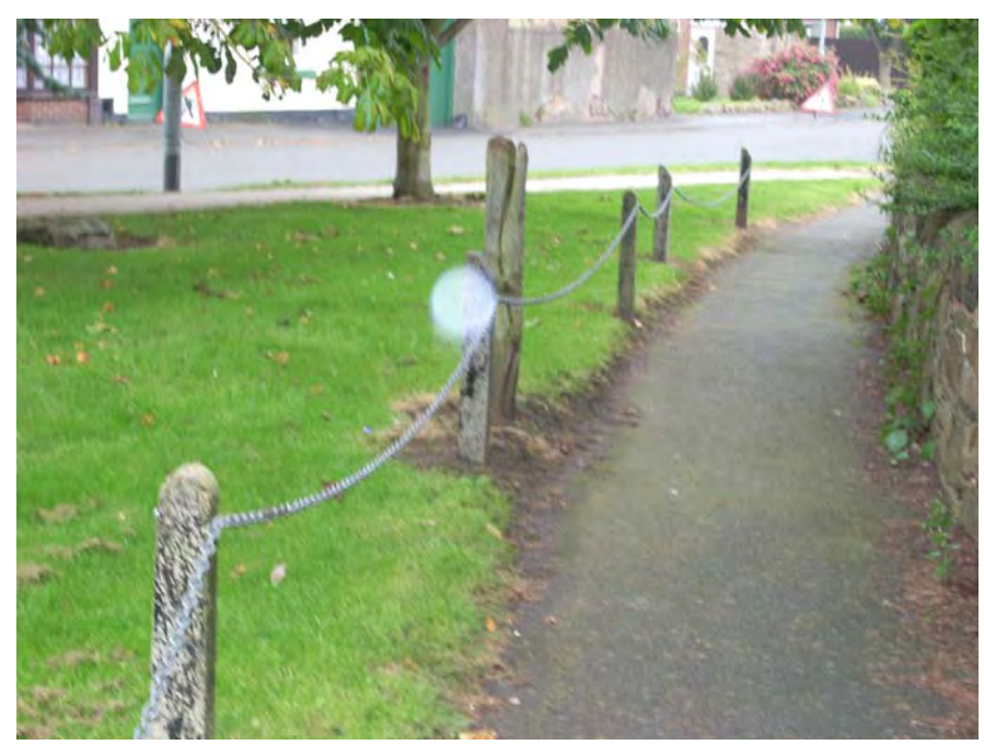
The unattractive concrete post and chain fence has recently been replaced with cast iron posts.