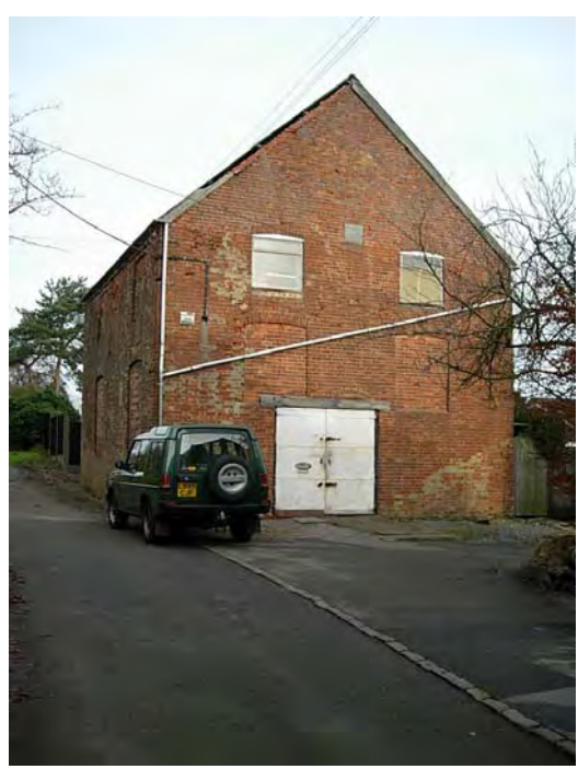
The former Methodist Chapel built 1811. Although the property's interior has been cleared and is now used for car repairs, the shell of the building is still of considerable visual and historical importance at the northern end of The Green.