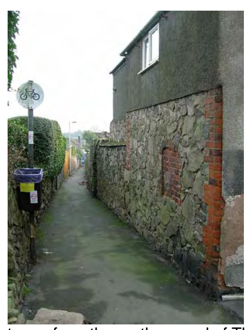
The jitty that runs from the northern end of The Green to Main Street is one of several jitties often flanked by important granite walls. These pedestrian routes traditionally linked Main Street to the ambient farmland.