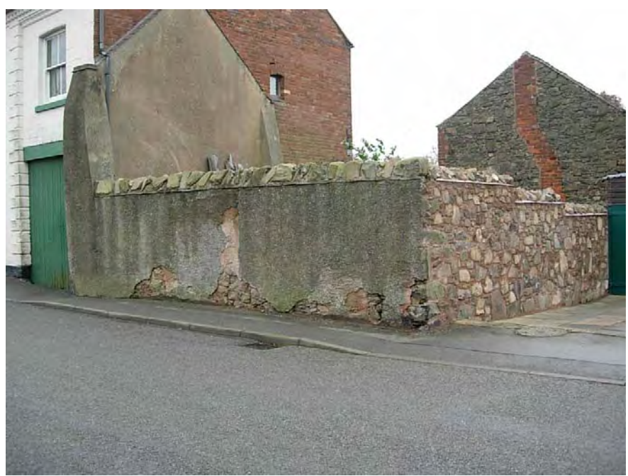
The rendering on the wall fronting 36 Main Street is unsightly and needs removing. This might require the wall to be re-built.