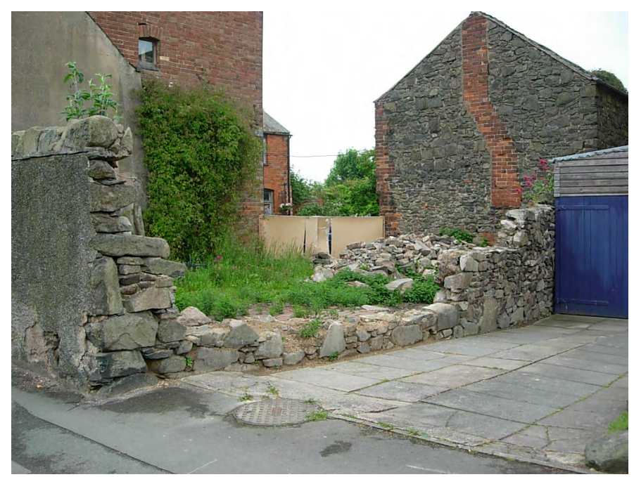
Granite walls are a dominant feature in the conservation area that need to be retained. The Borough Council has in the past provided small grants in order to help retain these important features.