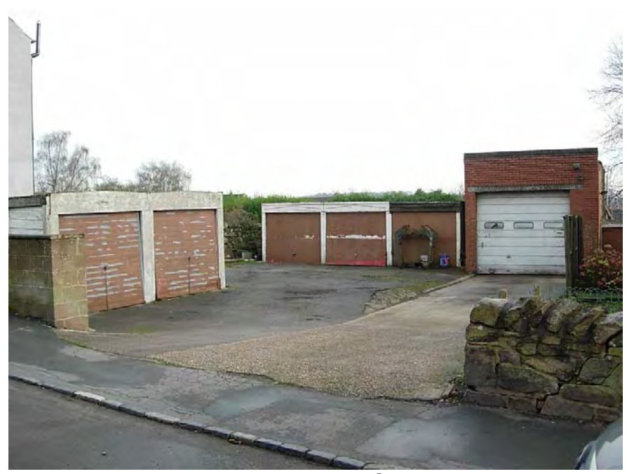
The open garage court at 38 The Green reduces the visual quality of area.