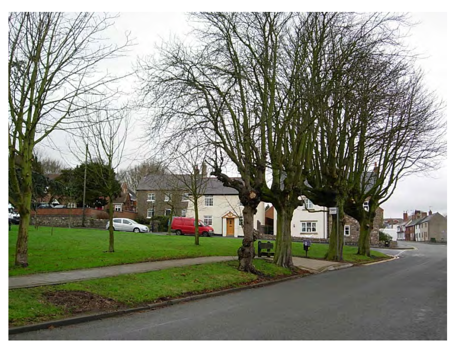
Saw Pit Green and the roadside trees soften the built environment at the southern end of Main Street.