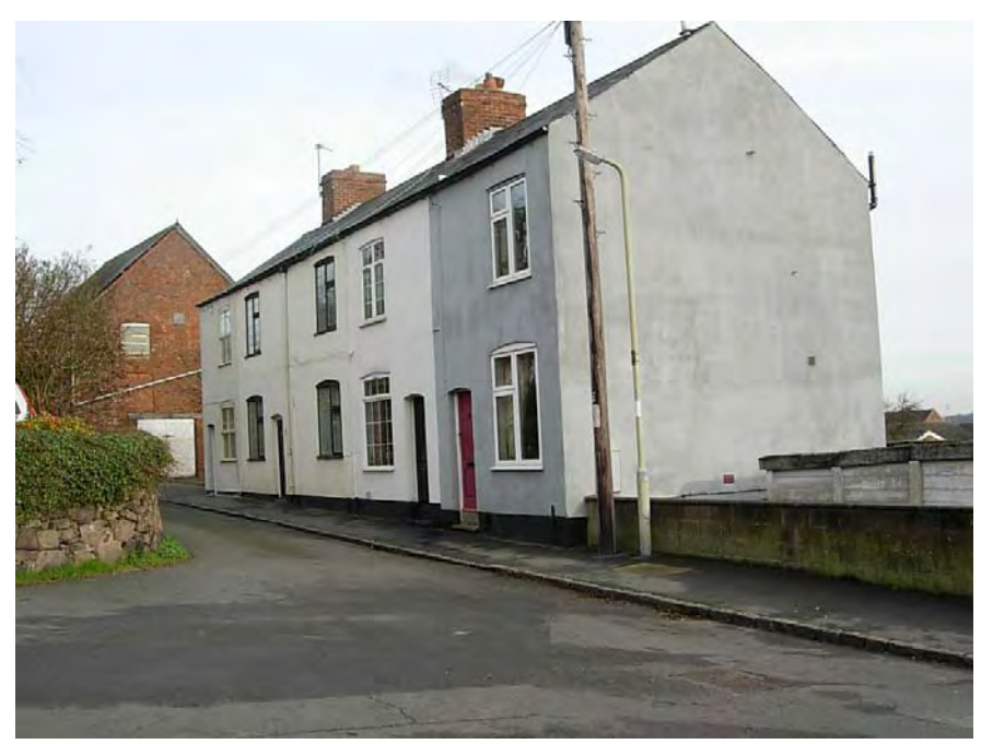
The introduction of modern replacement windows at 44 - 52 The Green has had a detrimental effect in this terrace.