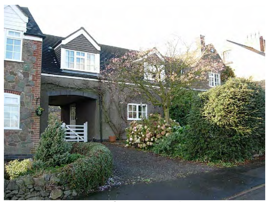
The dormers at 33 The Green are out of scale with the building fabric and the detailing does not follow the traditional form.