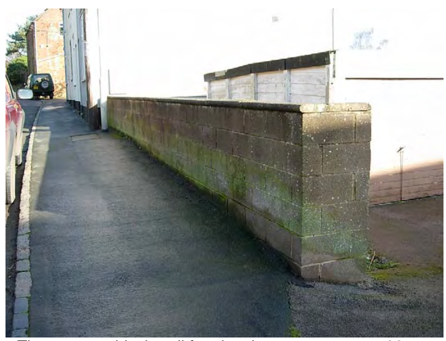
The concrete block wall fronting the garage court at 38 The Green needs replacing with a traditional granite wall.