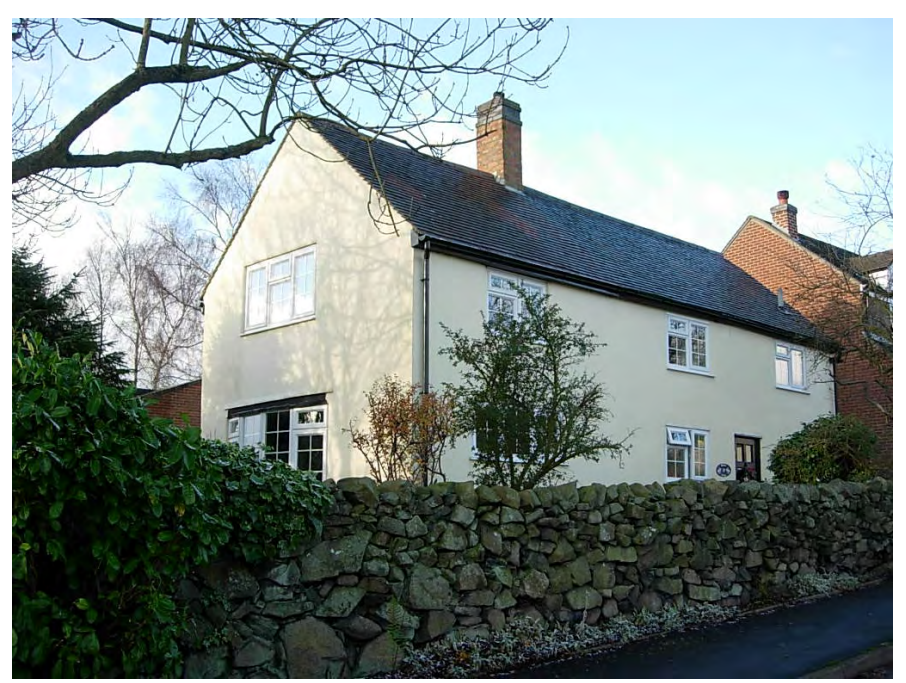
29 The Green suffers from overly large window openings in the gable and plastic windows.