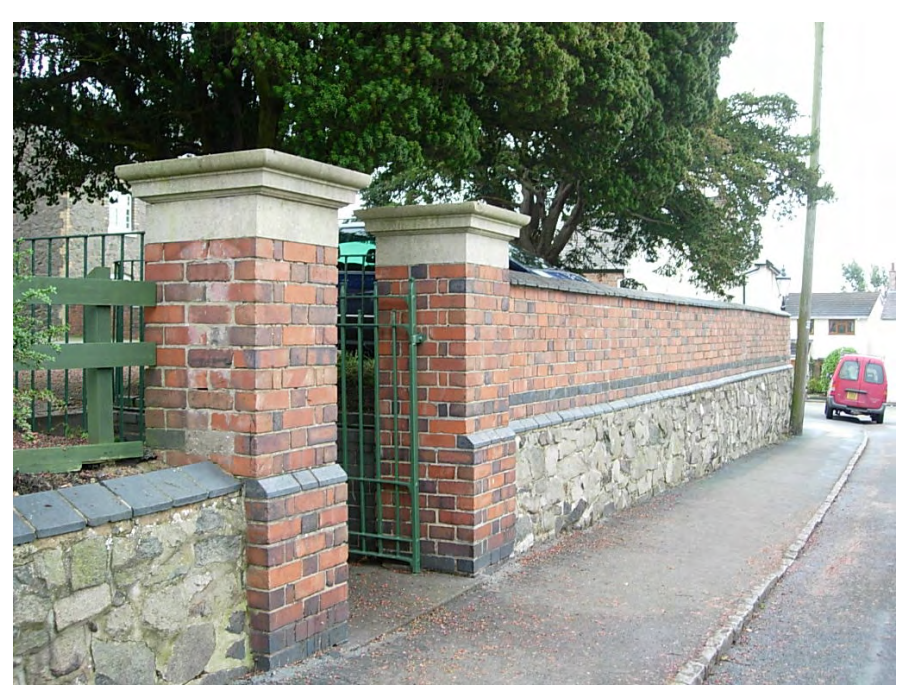
This solid brick wall that stand on a granite base is a dominant feature fronting the former village primary school and should be retained.