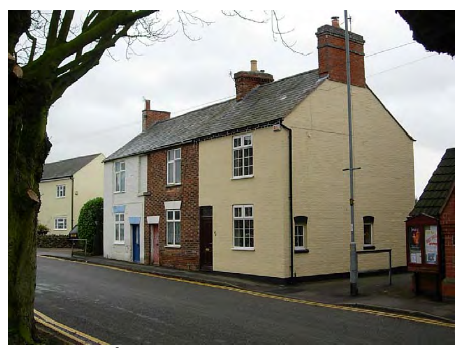
44 – 48 Main Street is a pleasant terrace that has lost its unity with new plastic windows inserted and two of the three properties painted/rendered.