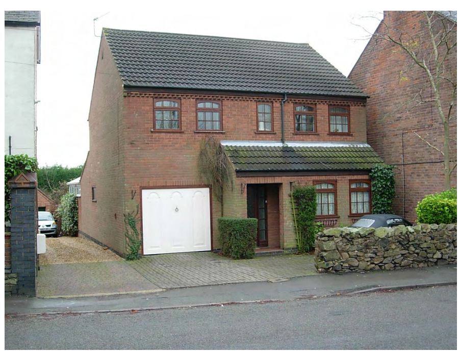
88 Main Street does not respect the village character with its integral garage and the use of modern materials.