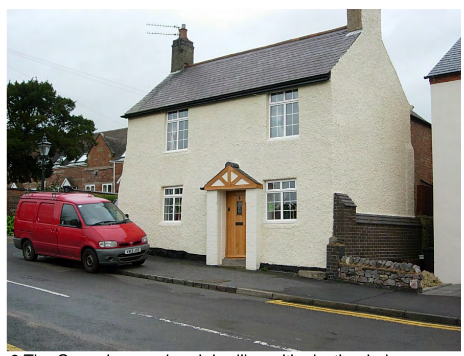
6 The Green is a rendered dwelling with plastic windows.