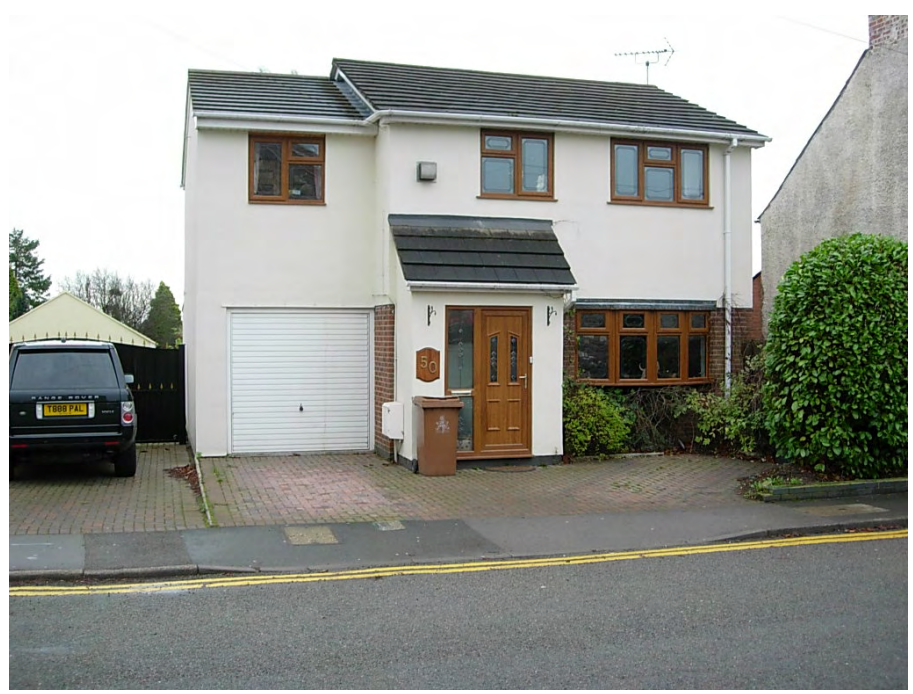
There are a number of properties built on Main Street that do not respect the traditional character by way of their design, materials, and open frontage.