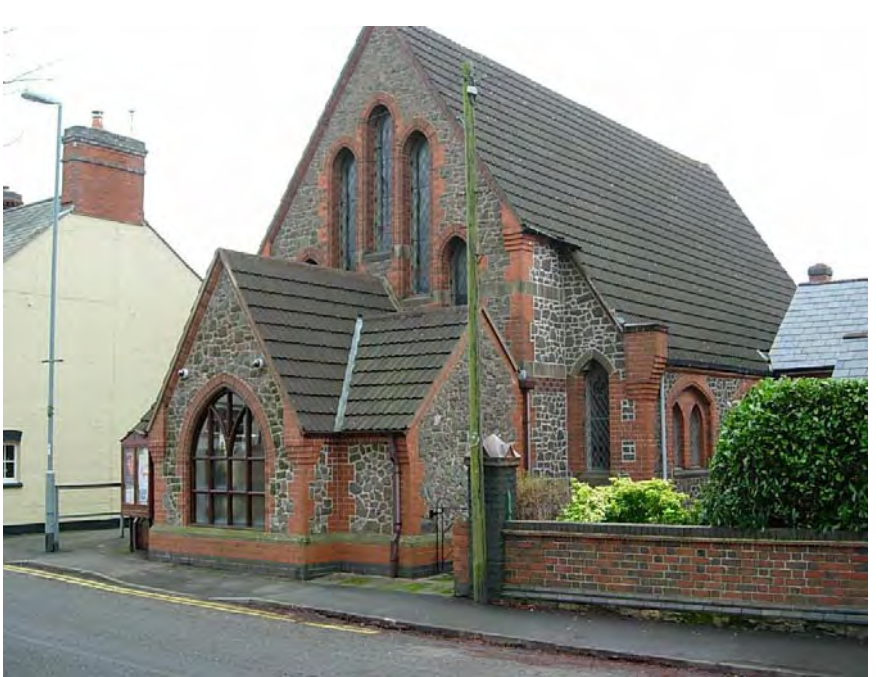
The Trinity Methodist Church is spoilt with the use of concrete tiles.