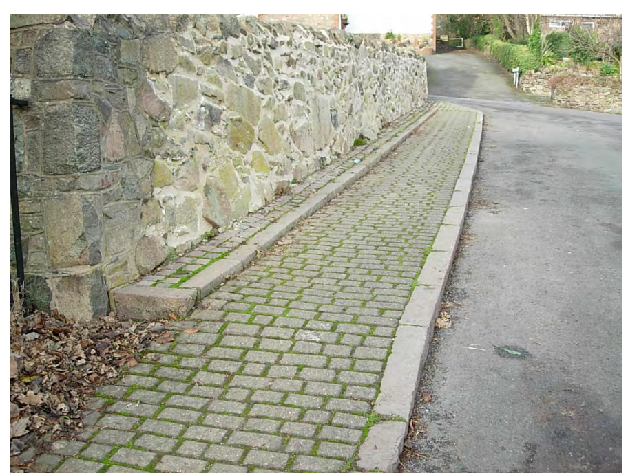
The use of granite setts to match the granite kerbs would have been preferable to the use of concrete paviours in this sensitive area fronting the parish church.