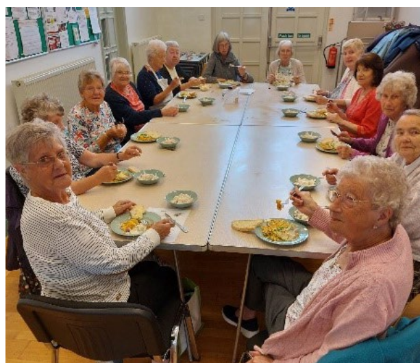
Ratby Cooking Group

Many of those who come along are concerned about the rising cost of living and benefit cuts, these sessions enable us to discuss what help and support is available to them through our welfare support services and partner agents.